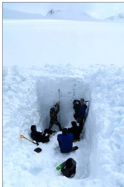
Students atop Eklutna Glacier dig a pit to measure snow density.

Geck and students will return for their research instruments and collect point data this fall. ●